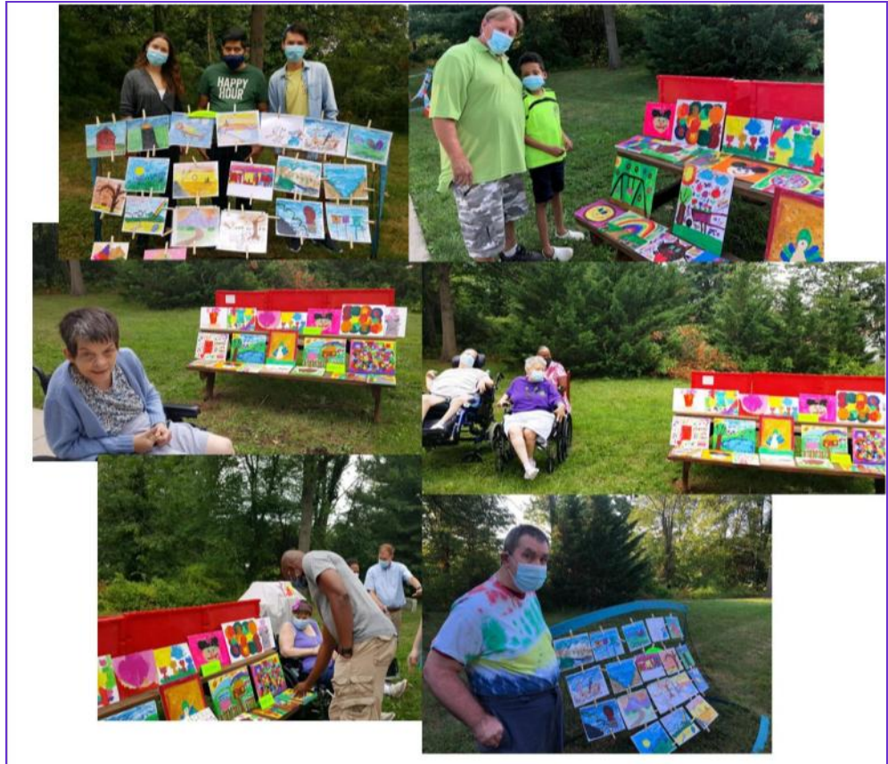
Congratulations to all of our artists who proudly displayed their artwork