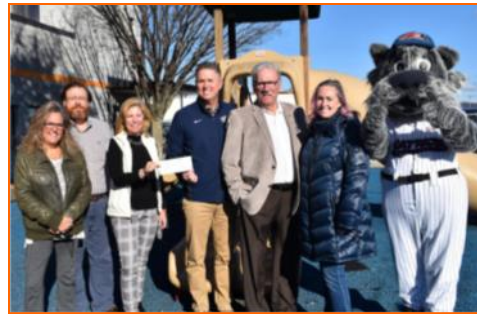
Members of the Executive Staff of the Somerset Patriots Presents Check to Family Member of the JDCCF Effected by Hurricane Ida.